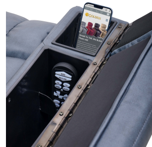
Right Arm: Wireless Charger & Storage Compartment

The Rhea comes standard with the following comfort and convenience features: