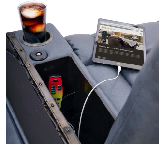
Left Arm: USB Charging Port, Cup Holder, Power Port & Storage Compartment