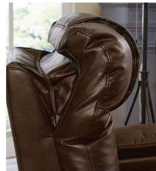
Adjustable Headrest & Lumbar